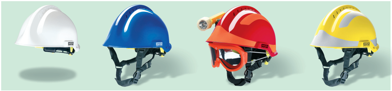
GA 32xx EN 397 Industrial risks version