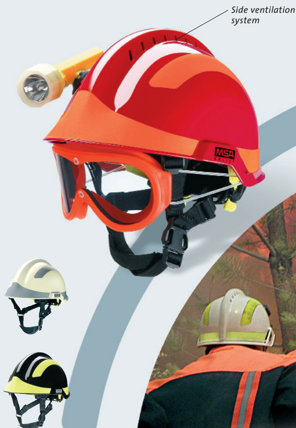
Side ventilation system

The F2 X TREM helmet version EN 12492, preserving the ventilation system and equipped with a special three point chin strap, is adapted to practically all rescue situations in a hazardous environment. Whether you are in an emergency station on a mountain or intervening following a natural catastrophe, your F2 X TREM helmet will provide you with ensured protection, while letting you forget about it on your head thanks to the lightweight and ergonomic design.